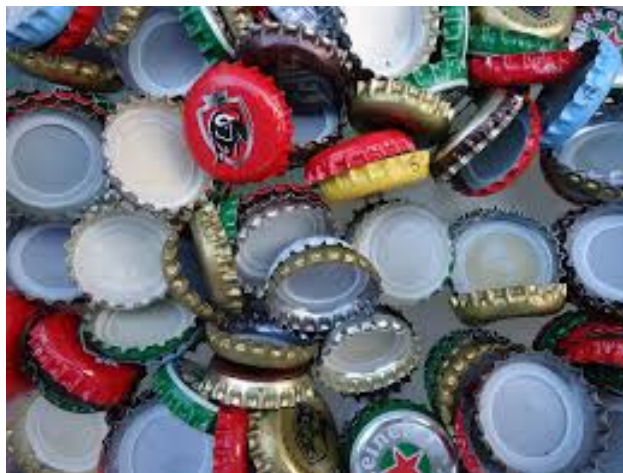
Steel Bottle cap