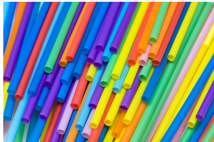
Plastic Drinking Straw