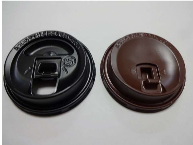
Coffee Cup Lid