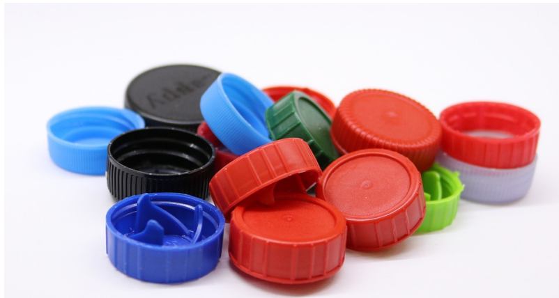
Plastic Bottle Lid