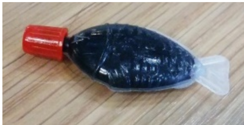
Sushi fish (soya sauce container)