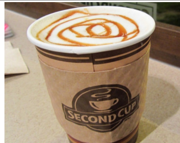
Take Away Coffee Cup