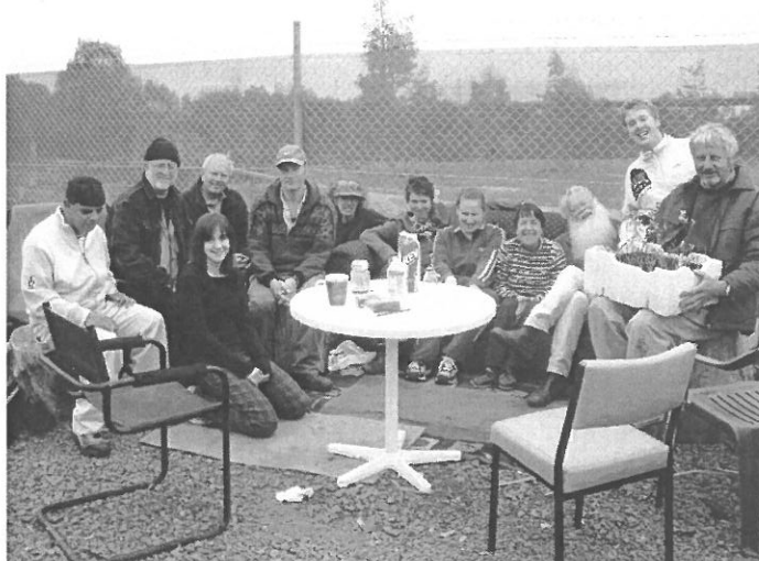
The NED group take a break from planting at Westgate Park